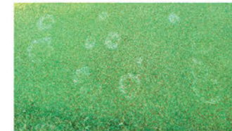
AFTER 3 days after Huma Gro Turf®